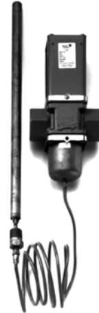
V47 Series Valve

If the V47 Series Temperature Actuated Modulating Valve fails to operate within its specifications, replace the unit. For a replacement valve, contact the nearest Johnson Controls® representative.